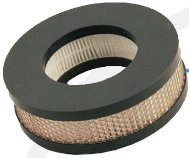
Patented Copper Coated HEPA Filter

This specialized filter features a "bacteriostatic" copper cage to trap particulate matter and reduce the potential for chamber contamination. This filter removes 99.97% of all airborne microbes