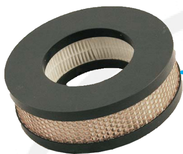
Patented Copper Coated HEPA Filter

This specialized filter features a "bacteriostatic" copper cage to trap particulate matter and reduce the potential for chamber contamination. This filter removes 99.97% of all airborne microbes